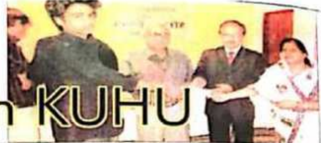
गंगापुर सिटी में छात्र श्रेष्ठता परीक्षा में कुहू इंटरनेशनल सी.से.स्कूल के छात्रों का सम्मान।