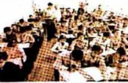
संभाग स्तरीय प्रतिभा खोज परीक्षा में बैठे 8 हजार विद्यार्थी।